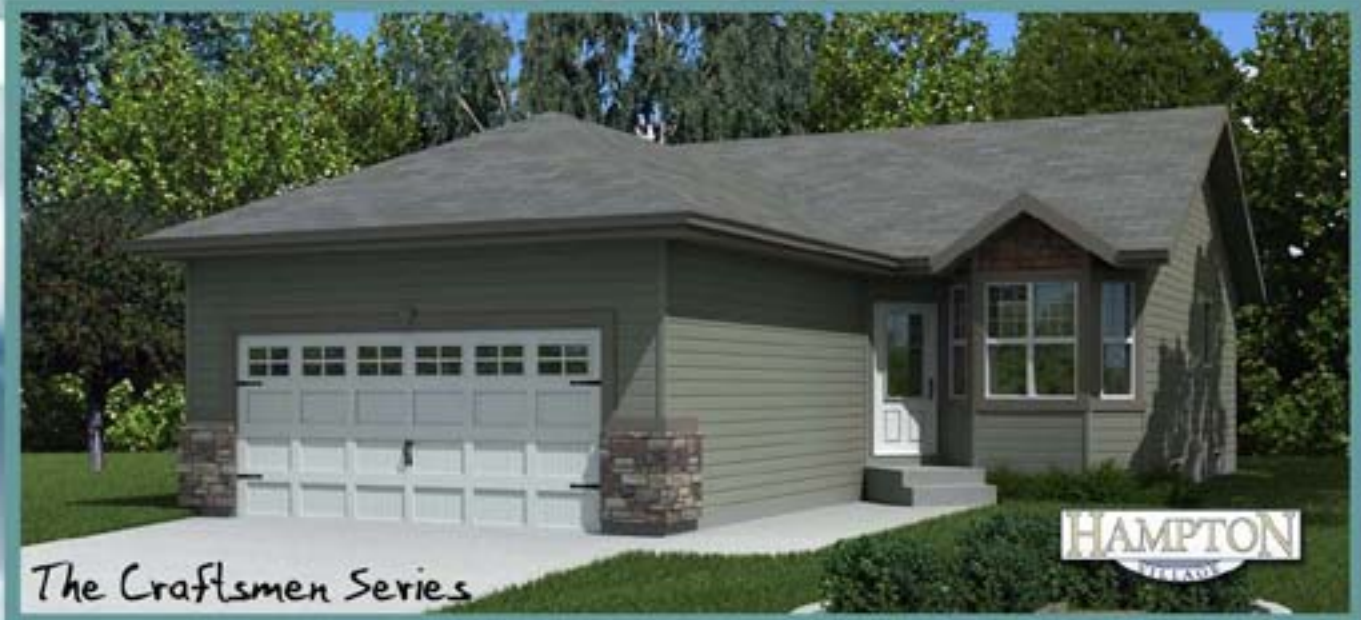
The Craftsmen Series