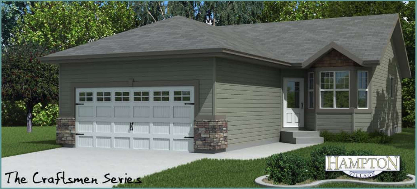
The Craftsmen Series