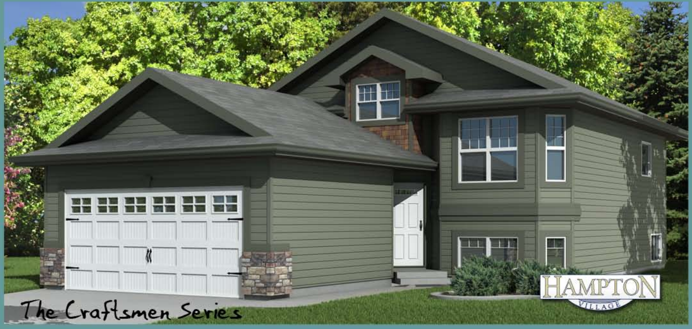
The Craftsmen Series